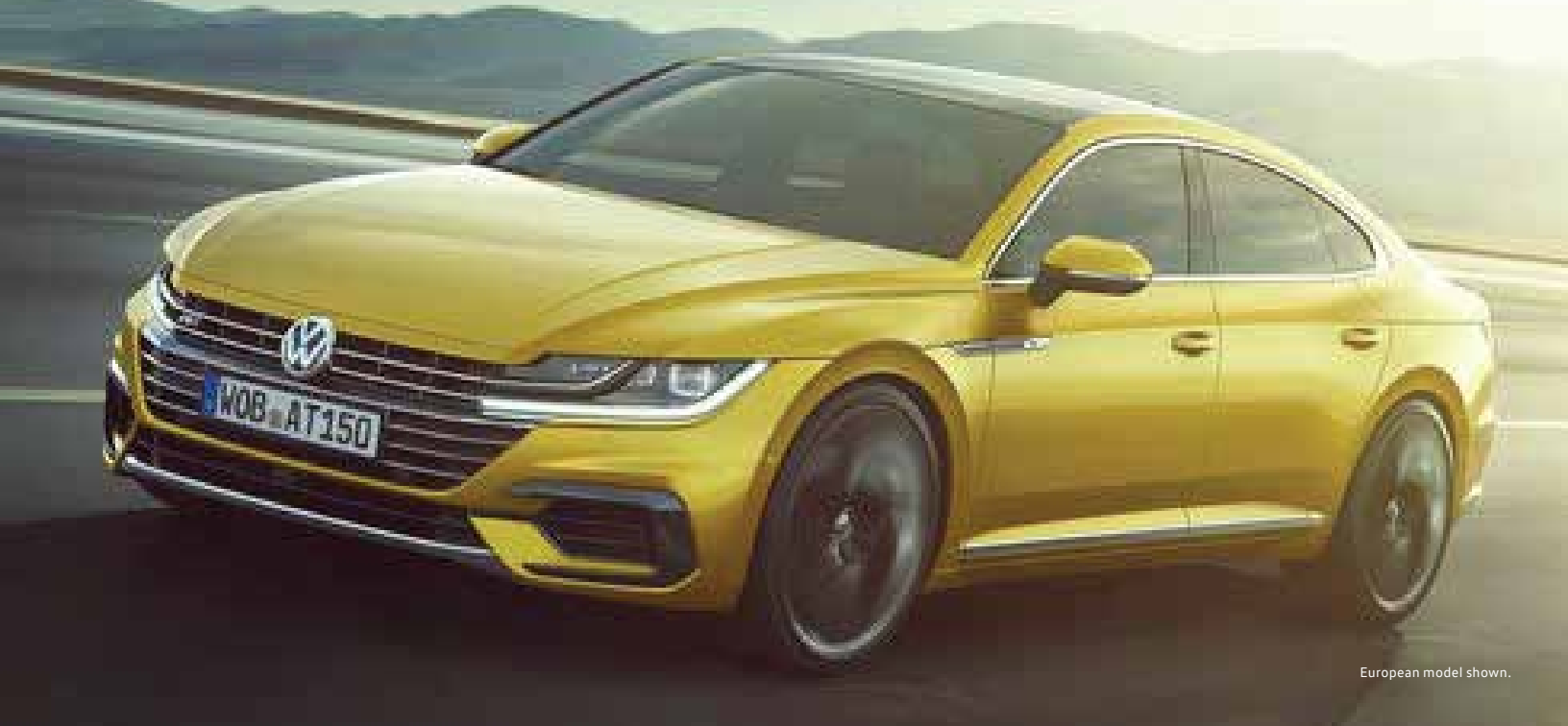
European model shown.